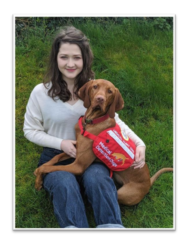
Life-threatening conditions no-warning symptoms